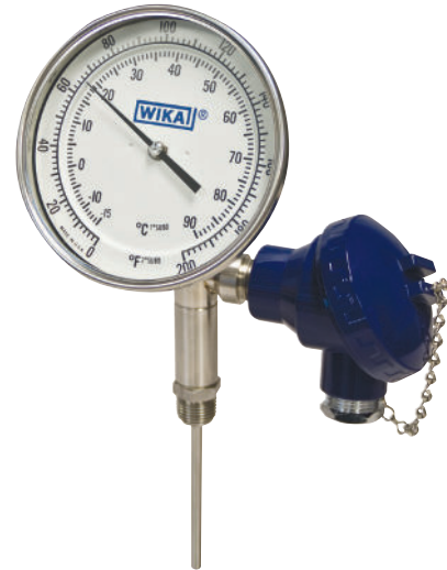
Twin-Temp Model TT.52 shown

White aluminum, dished, with black markings