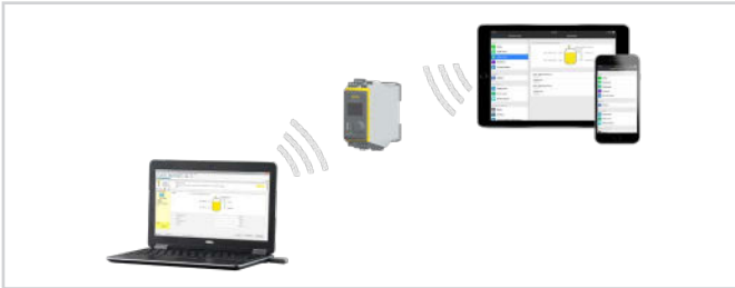
Wireless connection to smartphone/tablet/notebook

Operation is via a free app from the "Apple App Store", the "Google Play Store" or the "Baidu Store". Alternatively, adjustment can also be carried out via PACTware/DTM and a Windows PC.