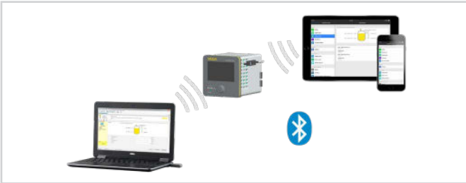
Wireless connection to smartphone/tablet/notebook

Operation is via a free app from the "Apple App Store", the "Google Play Store" or the "Baidu Store". Alternatively, adjustment can also be carried out via PACTware/DTM and a Windows PC.