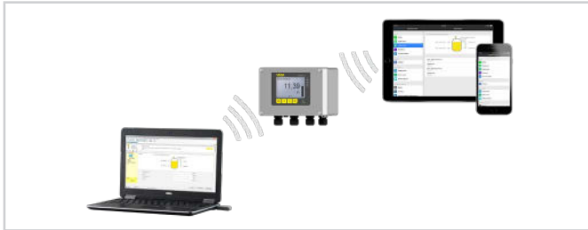
Wireless connection to smartphone/tablet/notebook

Operation is via a free app from the "Apple App Store", the "Google Play Store" or the "Baidu Store". Alternatively, adjustment can also be carried out via PACTware/DTM and a Windows PC.